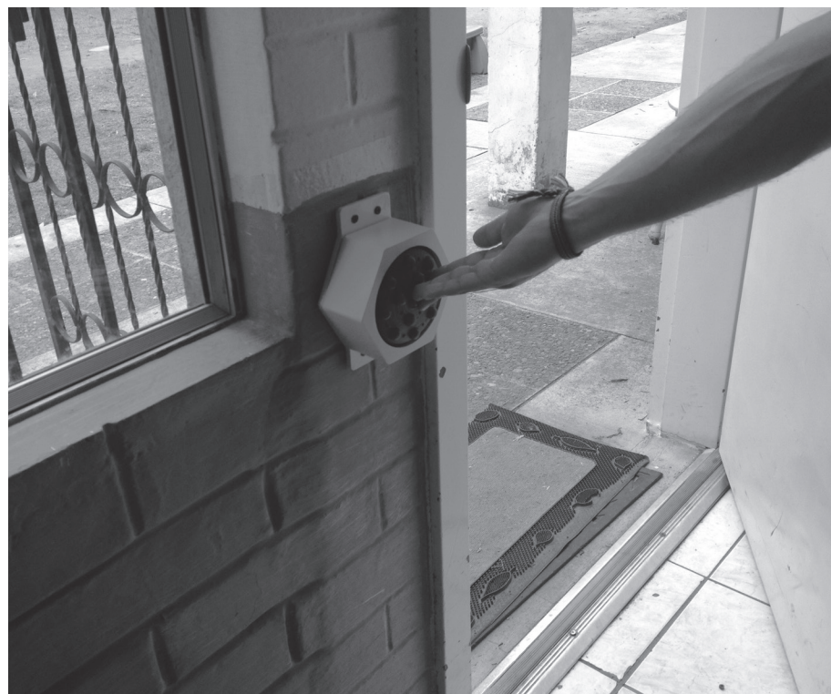
Figure 2. Communication Button

During semester 2, 15 students and 2 faculty members spent 9 days over the March spring break in Ecuador. They lived together in housing located on the FHC campuses. The PT students installed the 2 communication buttons at 1 FHC location (Figure 2) and the iPad AAC systems on the wheelchairs of the 3 users at a second location (Figure 3). The